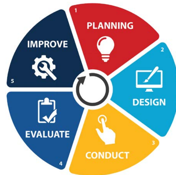
Dynamis' Exercise Design Cycle

Result: The functional exercises allowed Dynamis to identify capability gaps and areas of improvement for the DEST. As part of the improvement planning process, Dynamis developed thorough corrective action plans that set the baseline for future training and exercise activities, enhancing the overall preparedness and mission readiness of the interagency team.